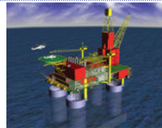
Phase 2, Lunskeye Platform